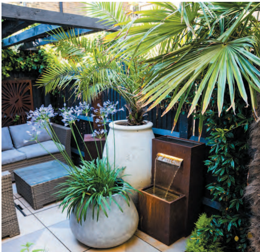
Pick evergreens with a variety of leaf shape and colour as well as ones that may have an evergreen species rather than a deciduous

Leigh-on-Sea-based Katrina Kieffer-Wells of Earth Designs shares her garden expertise