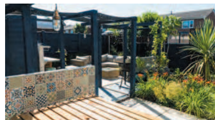
Brightly coloured tiles cheer up this space, even in the duller, less green months