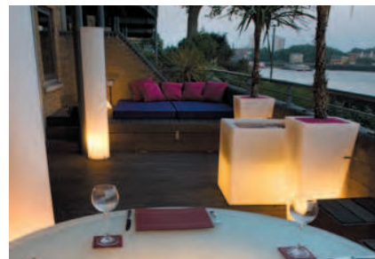
Bring your space alive at night with lighting