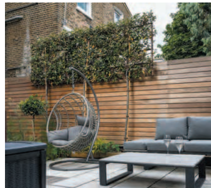
Evergreen pleached trees provide a living screen against overlooking upstairs windows