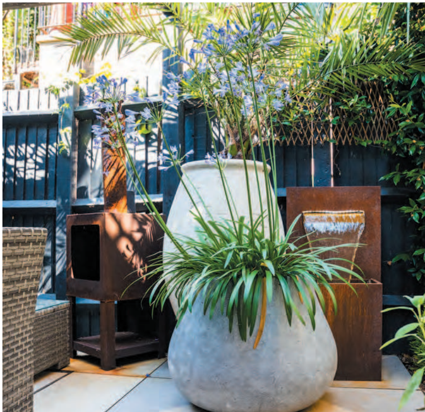
A tall potted plant creates a private corner in a garden overlooked by a neighbouring balcony

Leigh-on-Sea-based Katrina Kieffer-Wells of Earth Designs shares her garden expertise